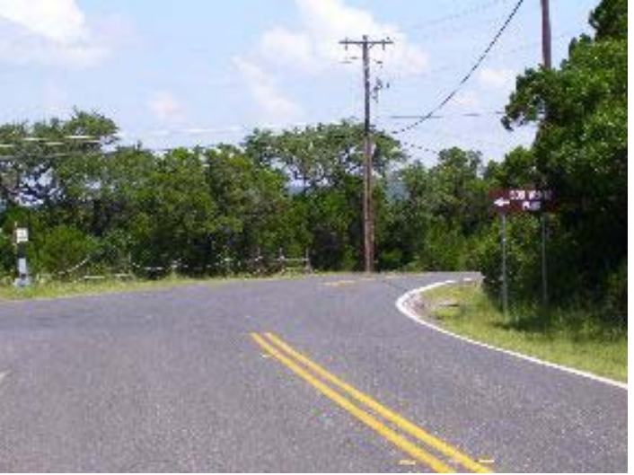
Turn to Windy Point, Note Sign