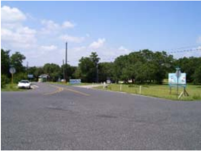
Entrance to Windy Point Park, on Right