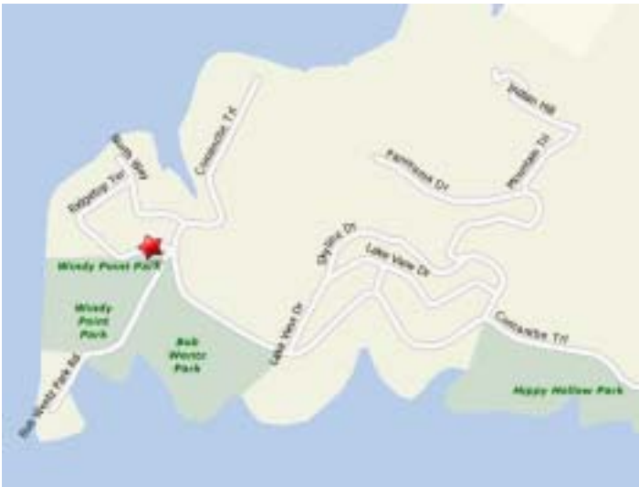
Party Map, Windy Point Park