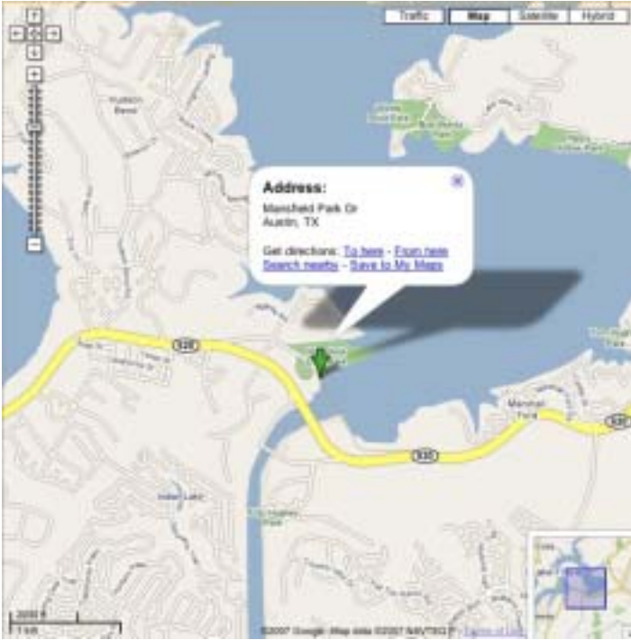
Launch Map, Mansfield Park