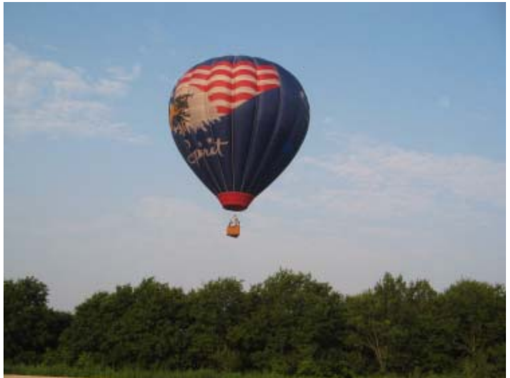
Spirit over Central Texas