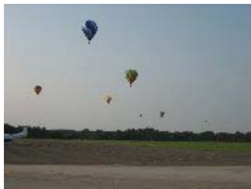
Sunday morning fly-in to the airfield

Saturday evening turned out to be an excellent flying opportunity as the winds were light and about half of the pilots we were able to fly into the field. Many great landings in front of the spectators followed by a very nice glow made this event a real crowd pleaser. But wait, it wasn't over. Sunday morning was another wonderfully cooperative weather day, so a dozen or so balloons flew into the field again.