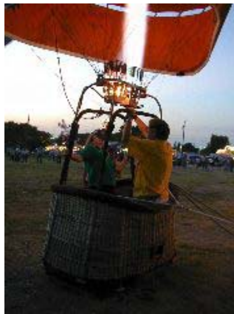
Sprin Ho Glow, 2005