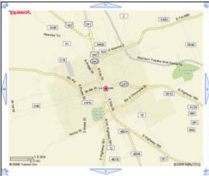
Lampasas, Spring-Ho Map

“Rhonda Fellows” rhondafellows@hotmail.com