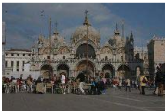
St Mark's Square (famous to some people)