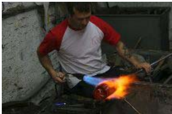
Murano Glass in Venice.