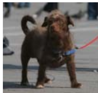
Bonnie's Dog's Twin